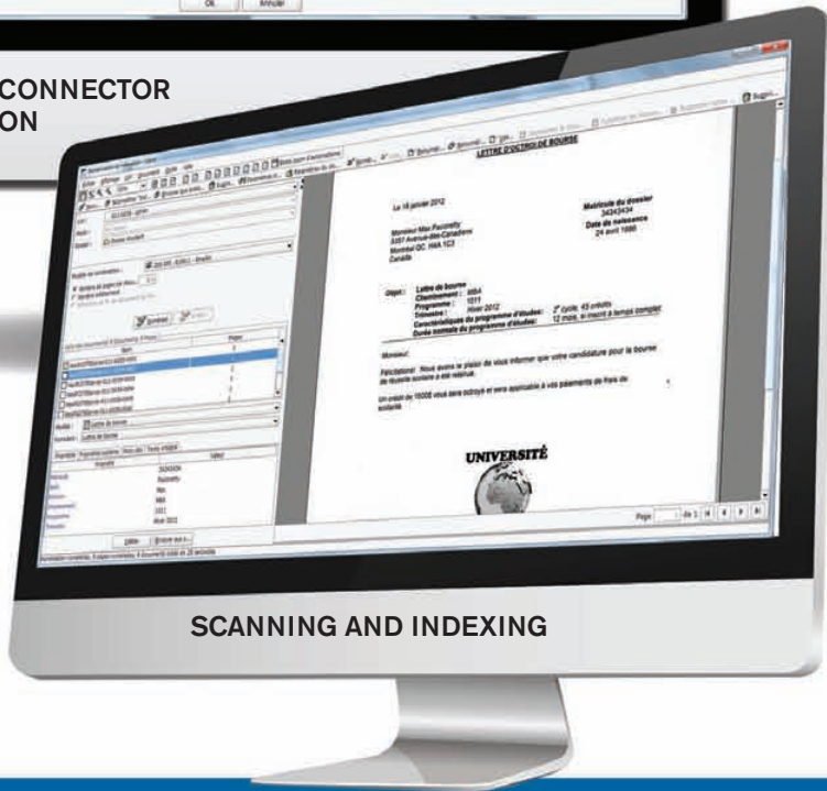
SCANNING AND INDEXING